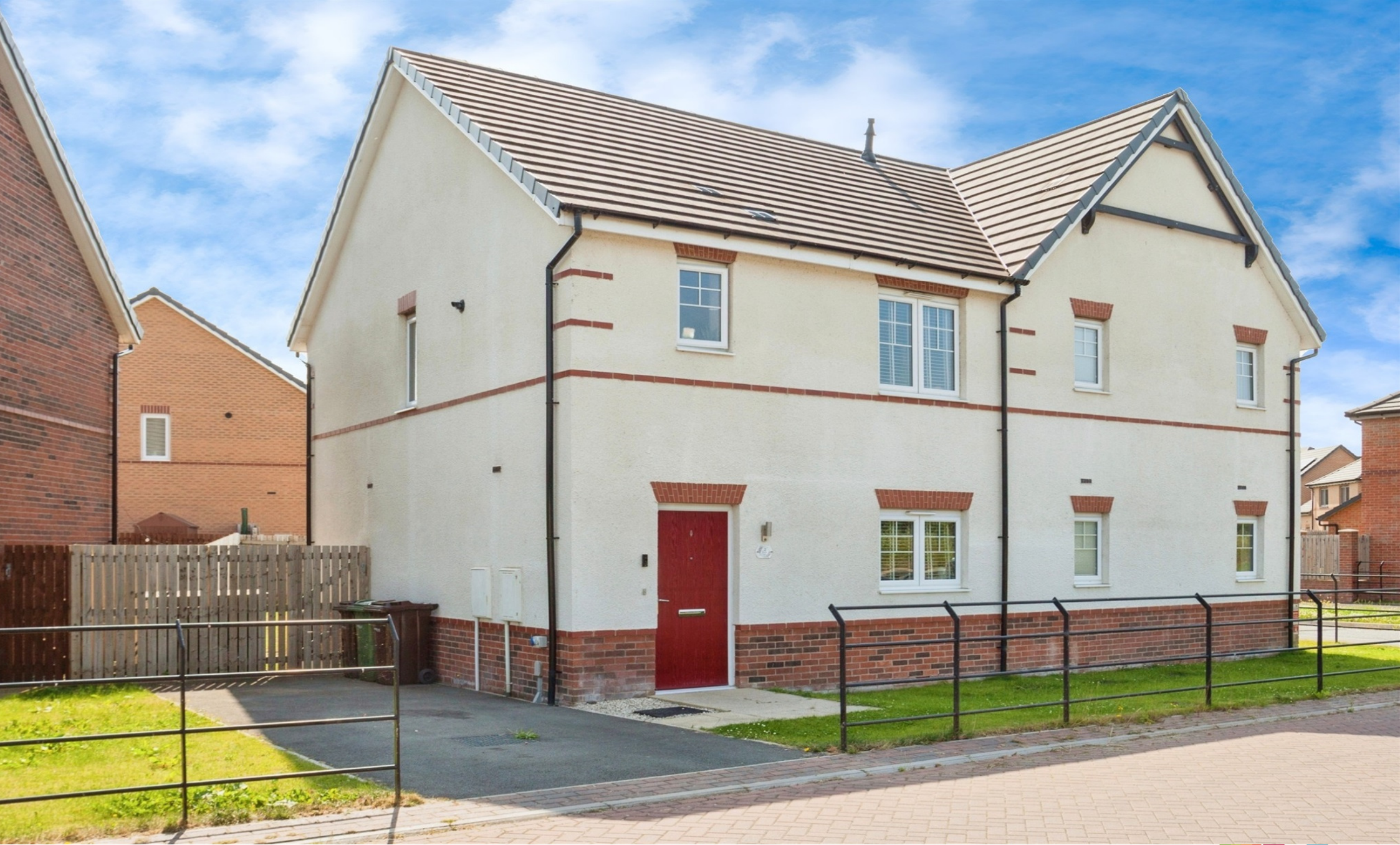
Little Wood Crescent, Wakefield WF1 5FJ