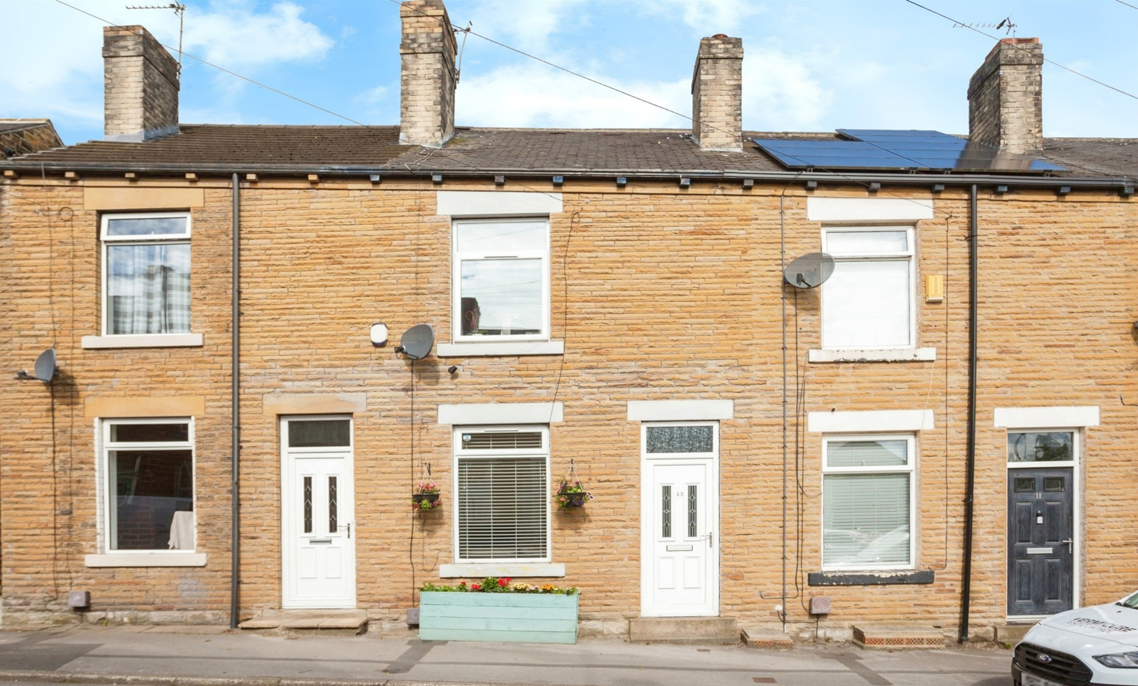
Pawson Street, Robin Hood Wakefield WF3 3BH