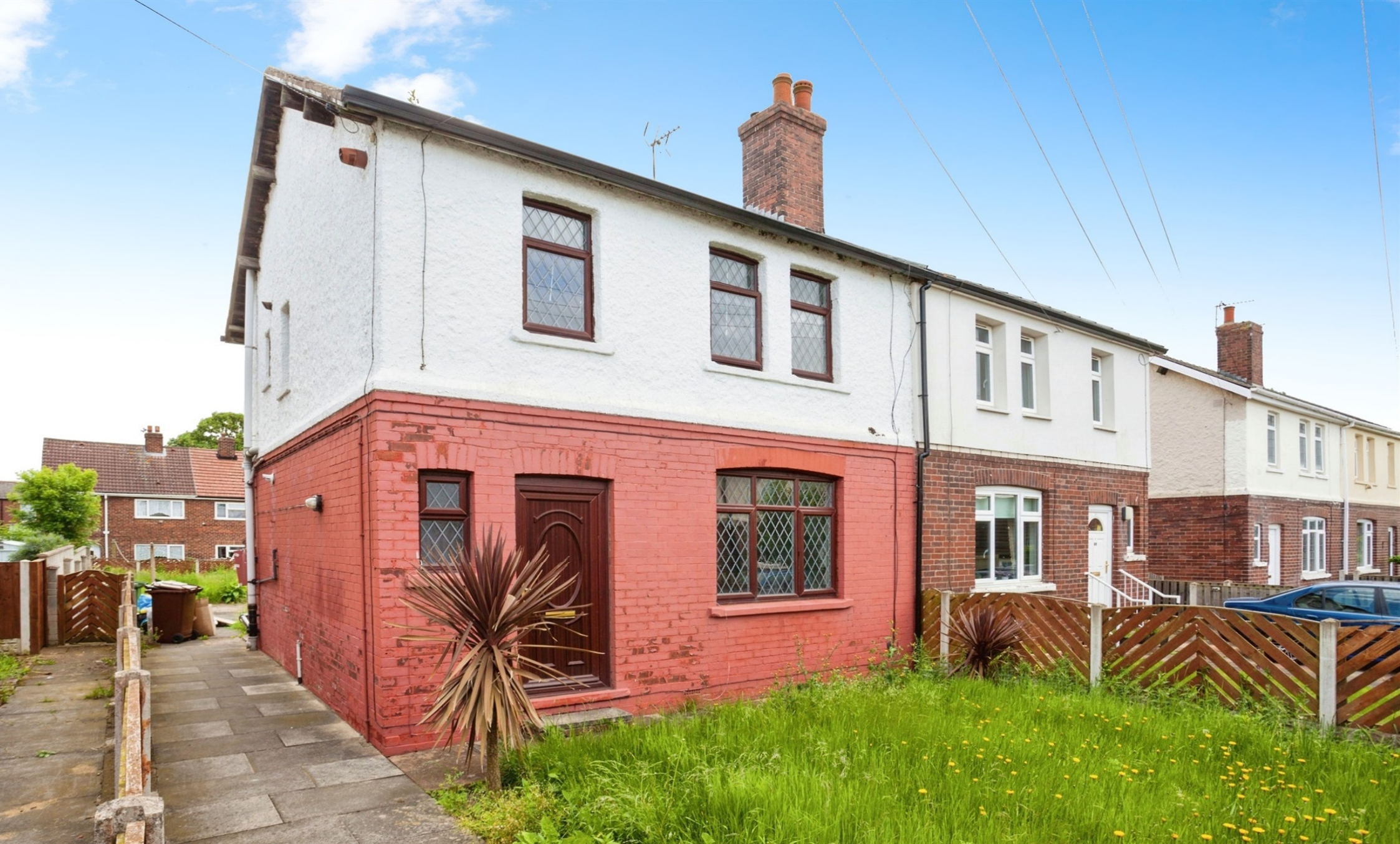
Walton View, Crofton Wakefield WF4 1NJ