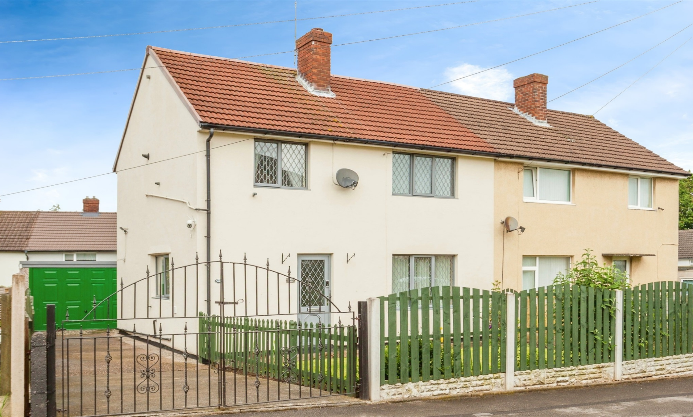
Hillcrest, Havercroft Wakefield WF4 2EW