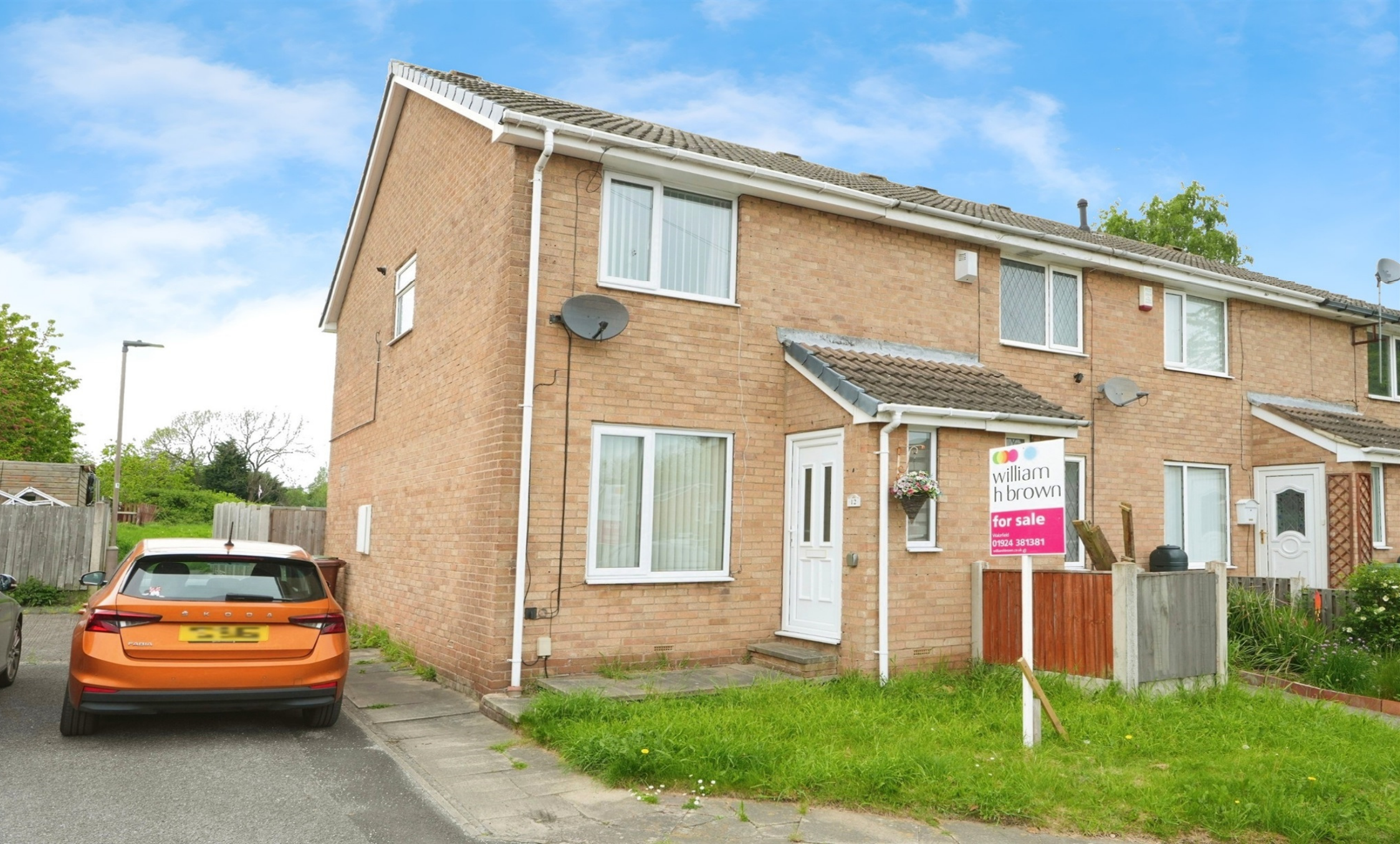
Rowan Court, Wakefield WF2 0HL