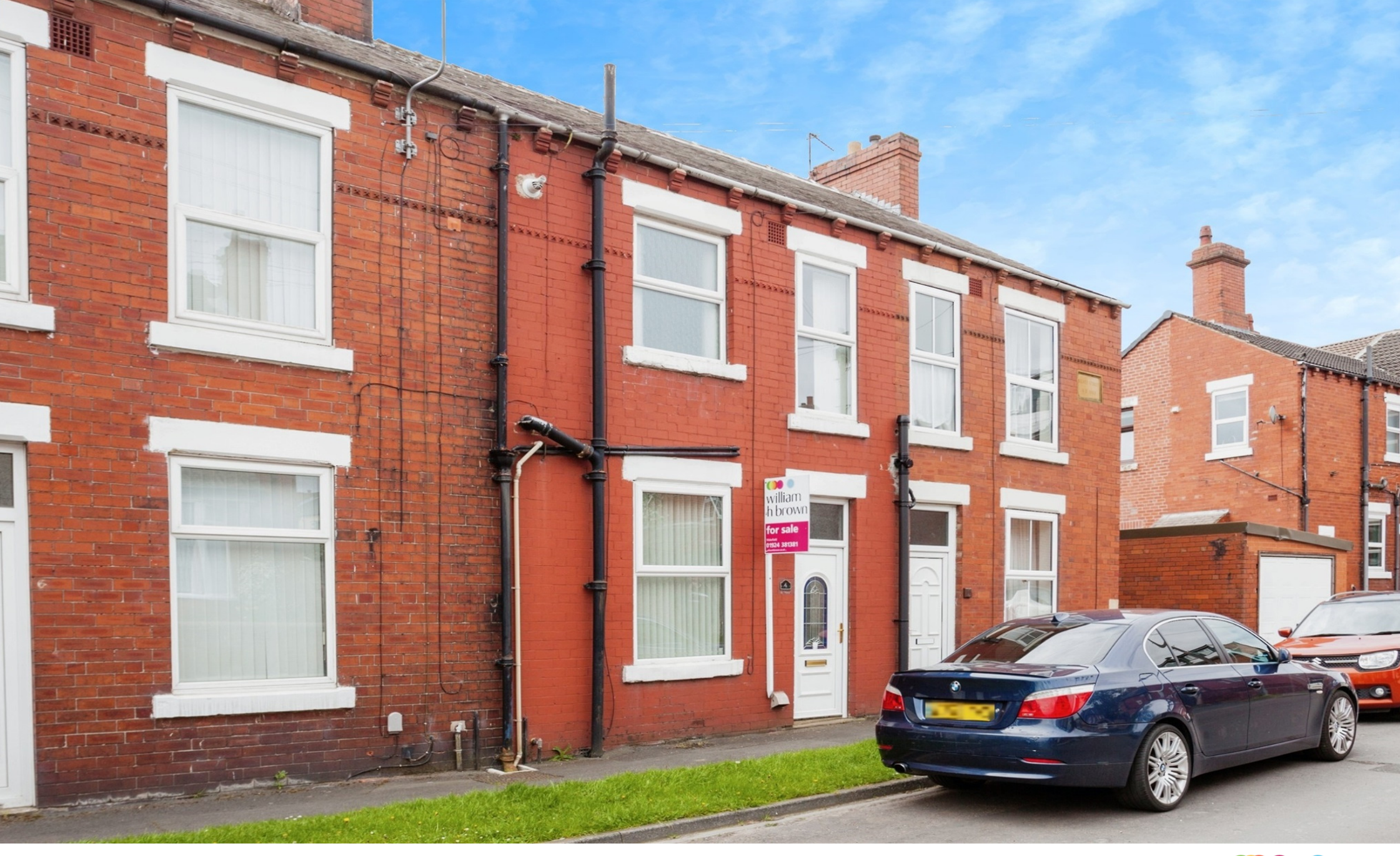
Silver Street, Newton Hill Wakefield WF1 2HZ