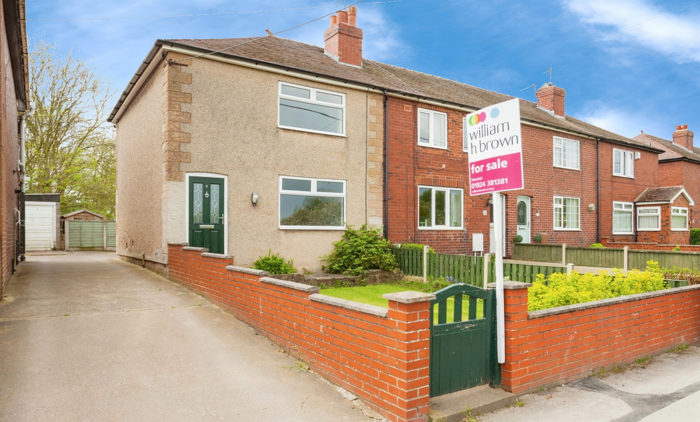
Fernside, Sharlston Common Wakefield WF4 1ED