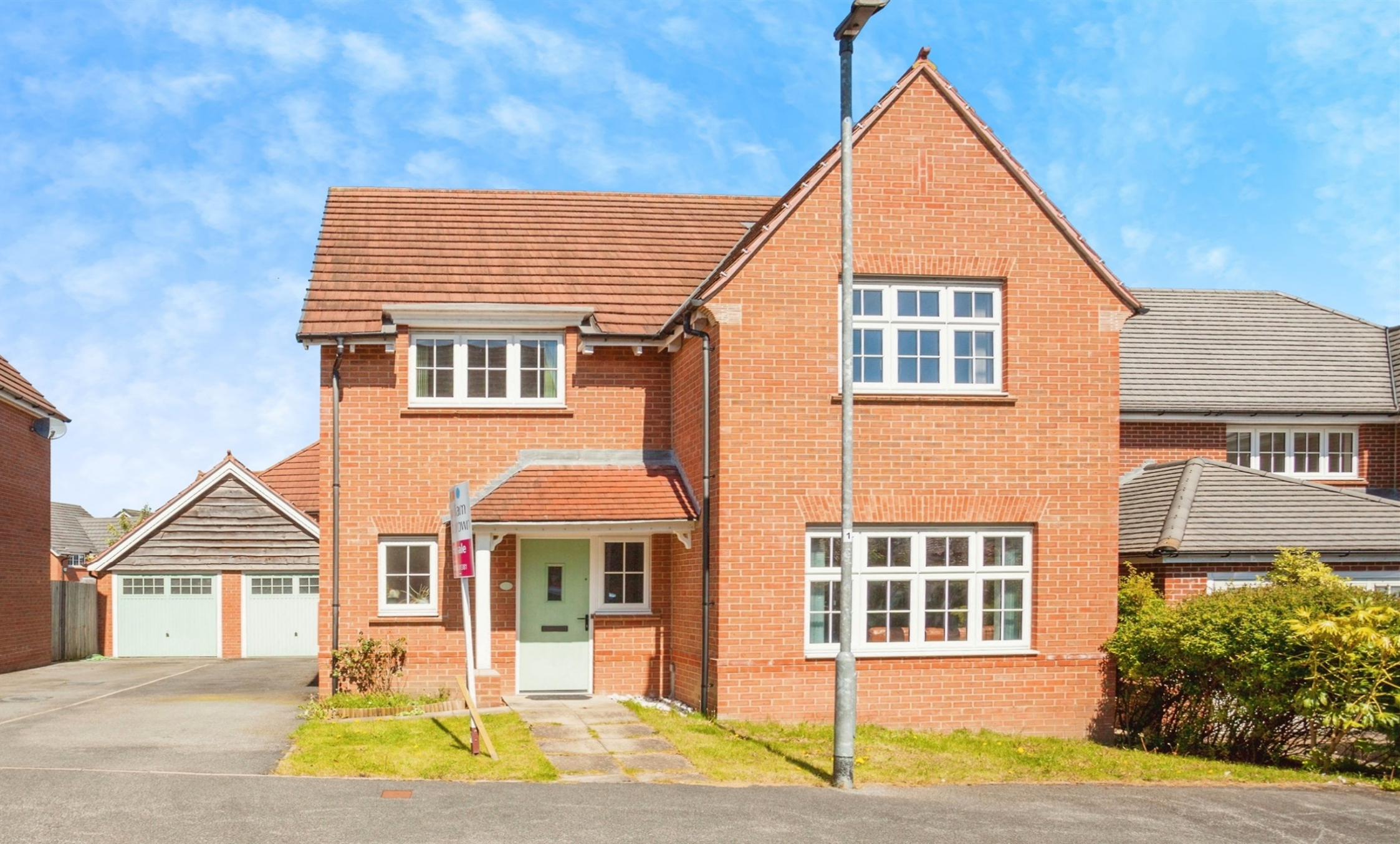
Manor Gardens, Crofton Wakefield WF4 1RJ