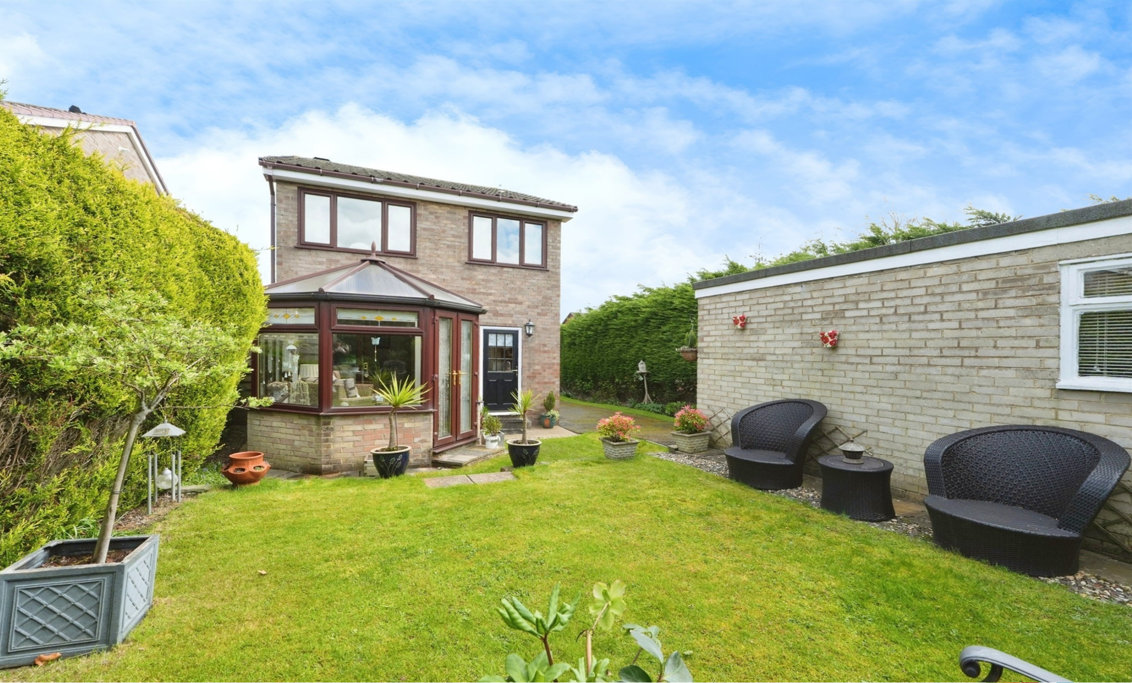
Kulima Cavewell Close, Ossett WF5 0SN