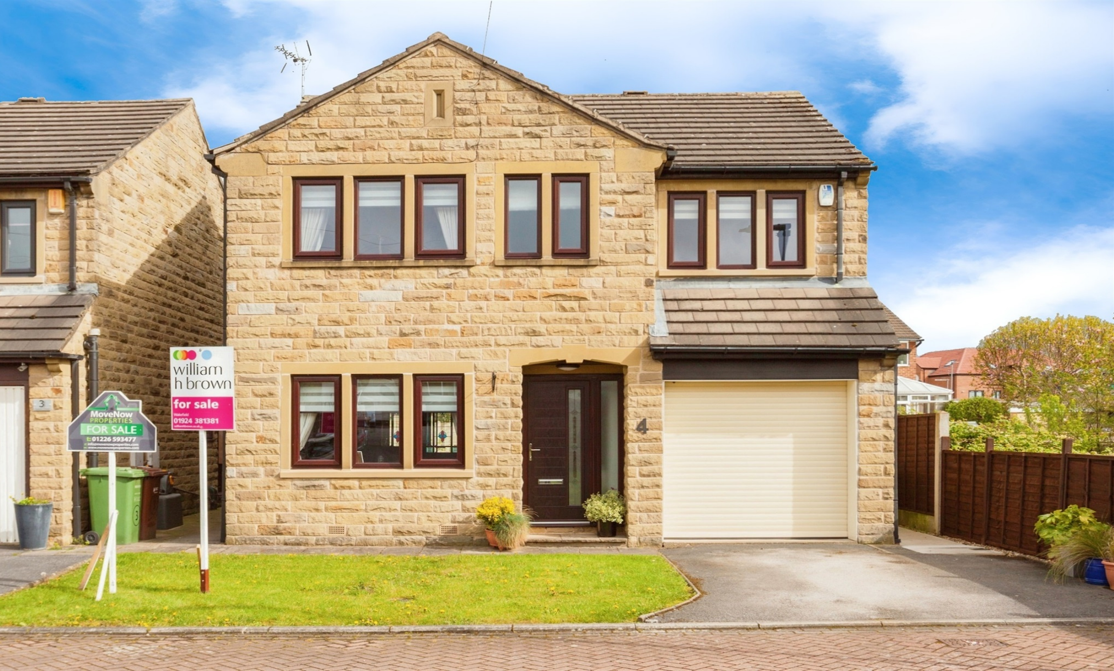
Lingwell Chase, Lofthouse Gate Wakefield WF3 3JB