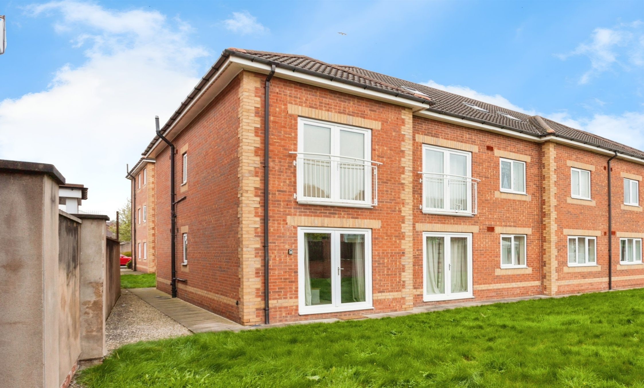
Lagentium Plaza, Castleford WF10 4PP