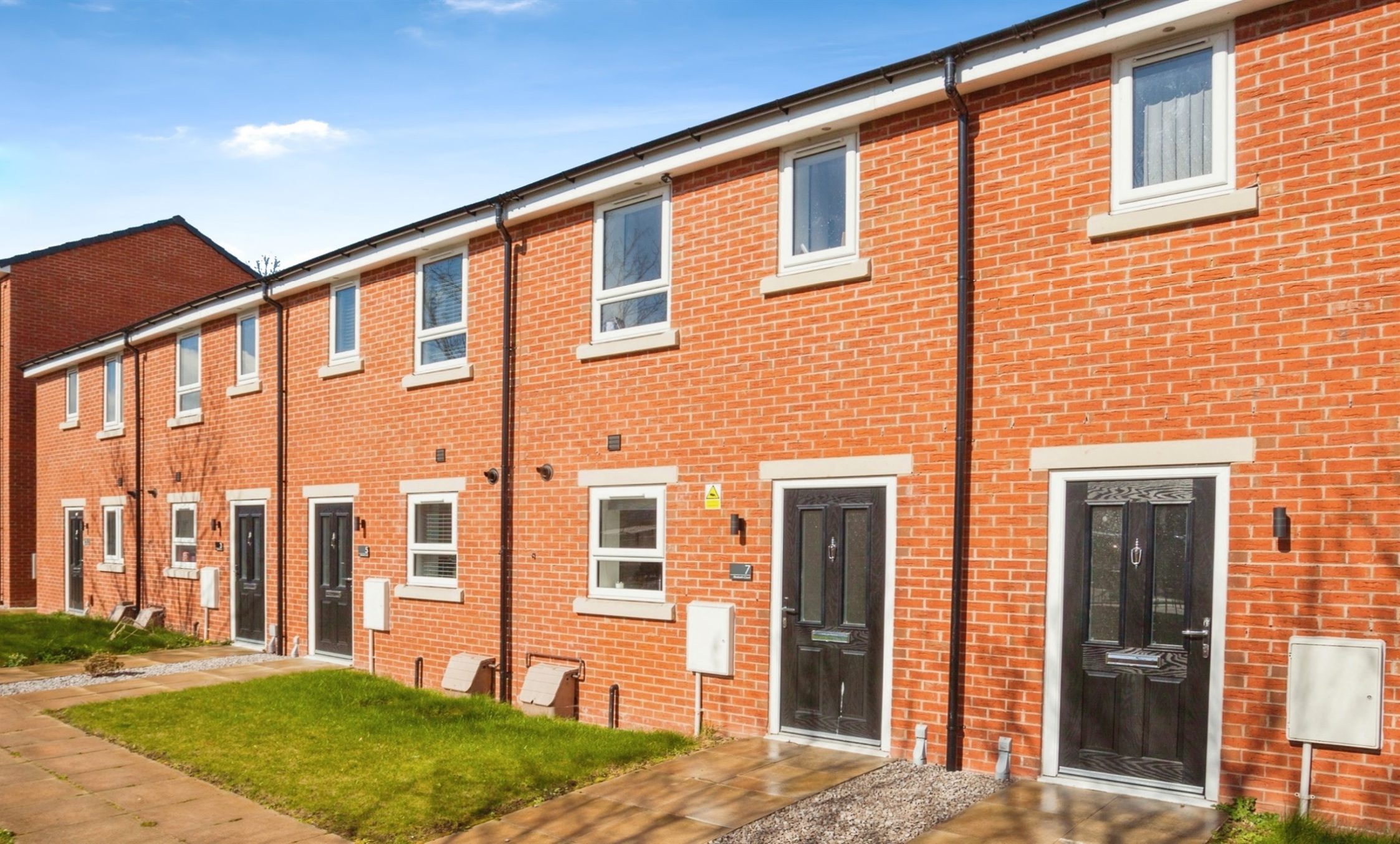
Elizabeth Court, WAKEFIELD WF2 9NG