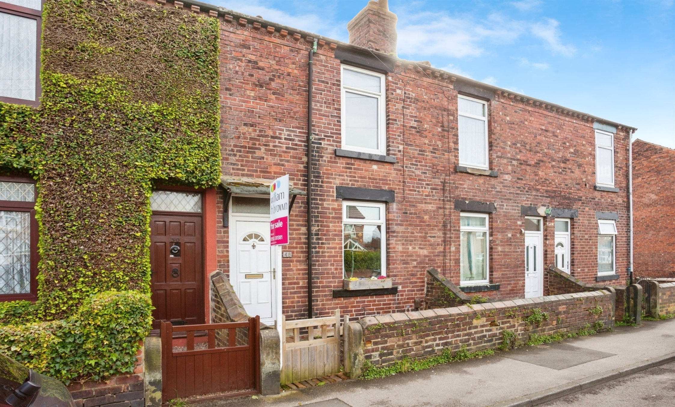
Sparable Lane, Wakefield WF1 5LW