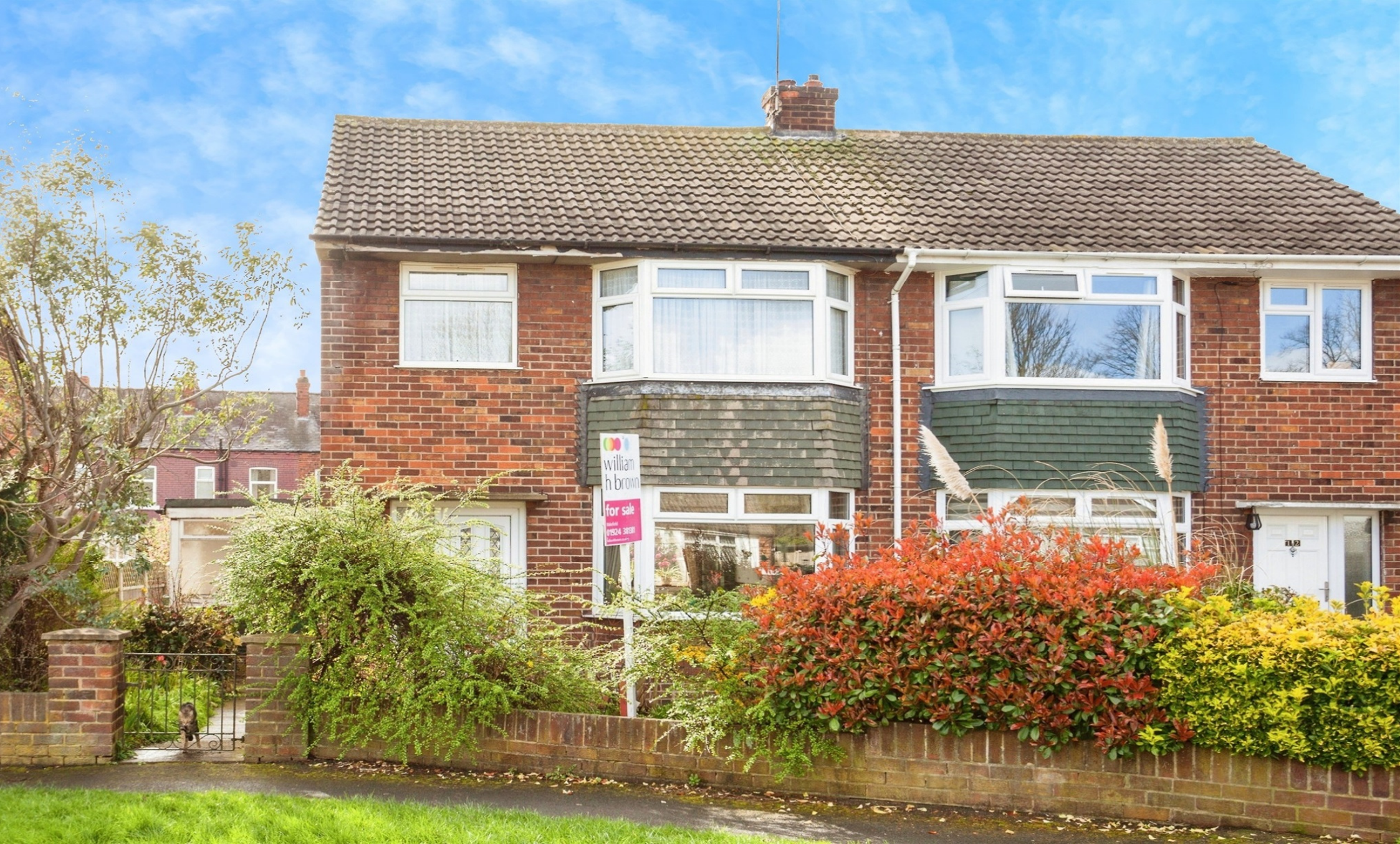
Briar Grove, Wakefield WF1 5LT