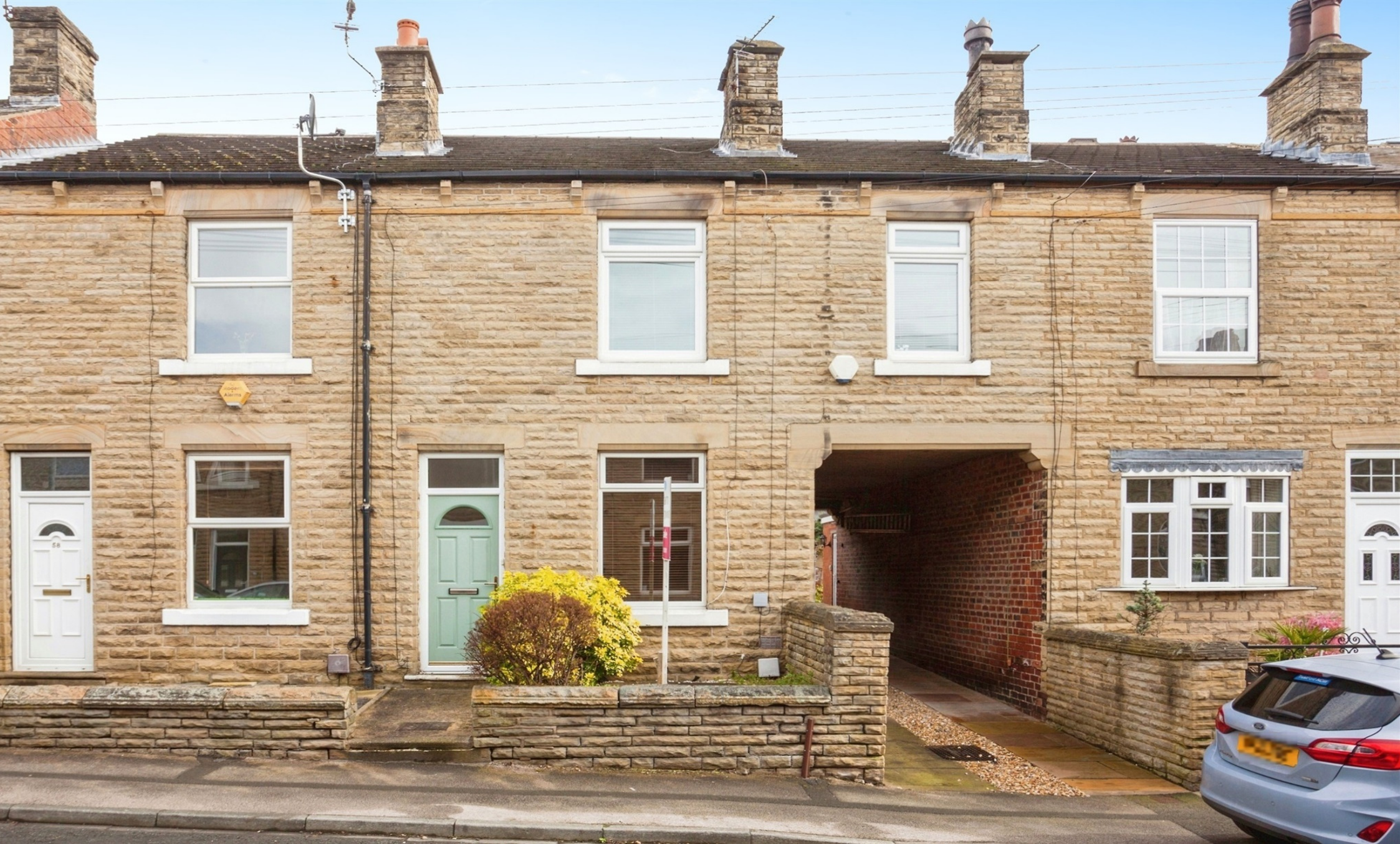
Park Street, Horbury Wakefield WF4 6AB