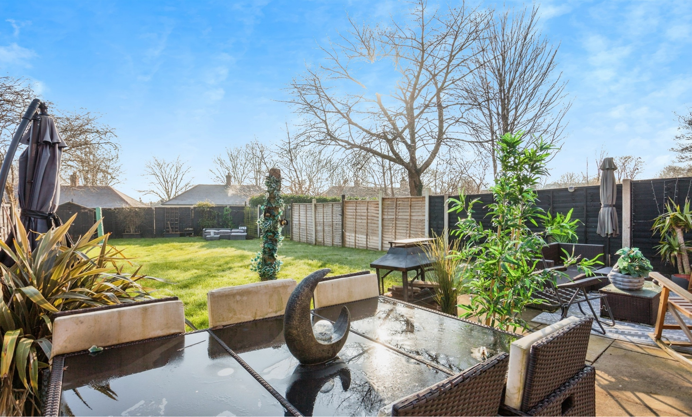
Flanshaw Grove, Wakefield WF2 9LH