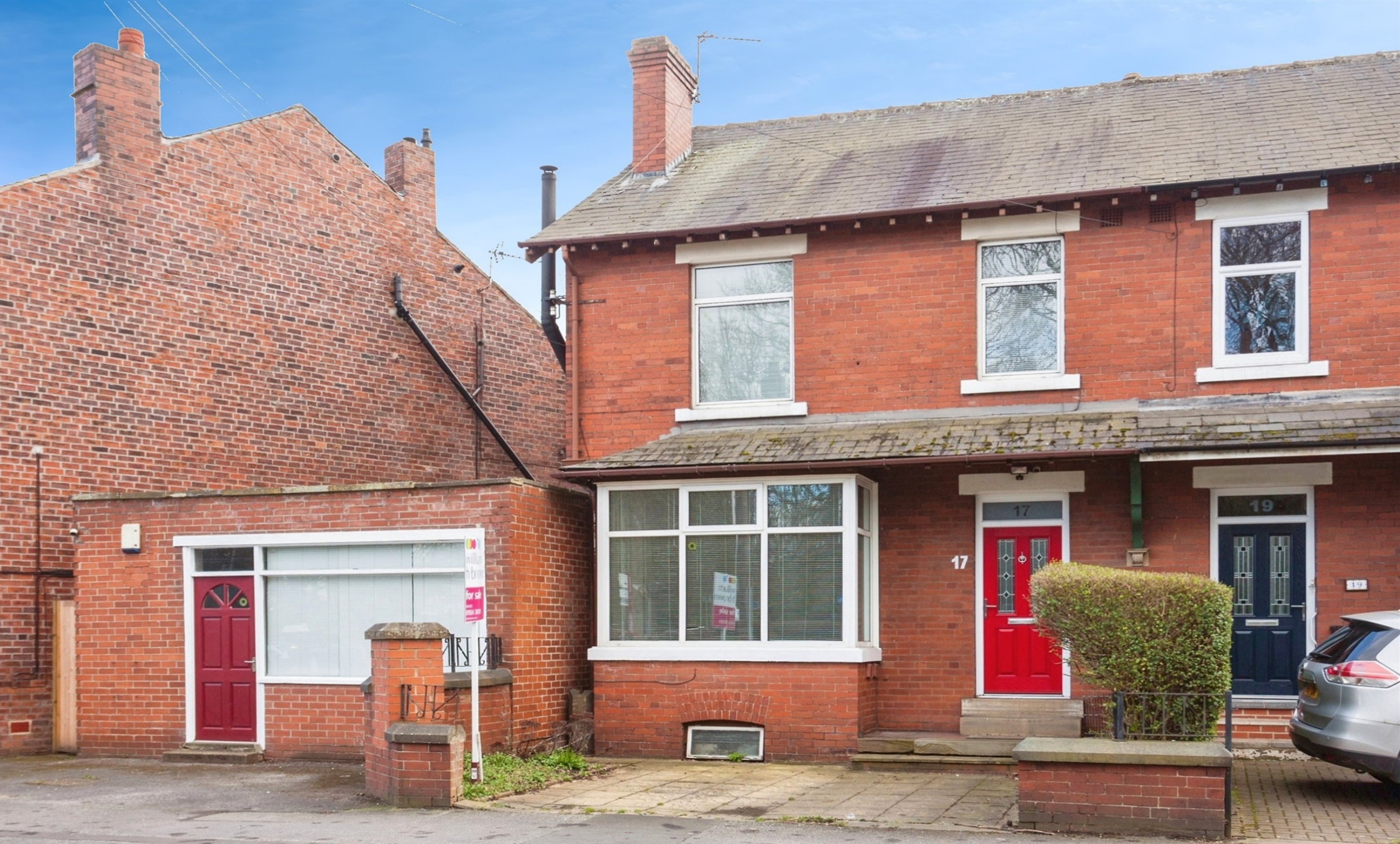
Thornes Road, Wakefield WF2 8PL