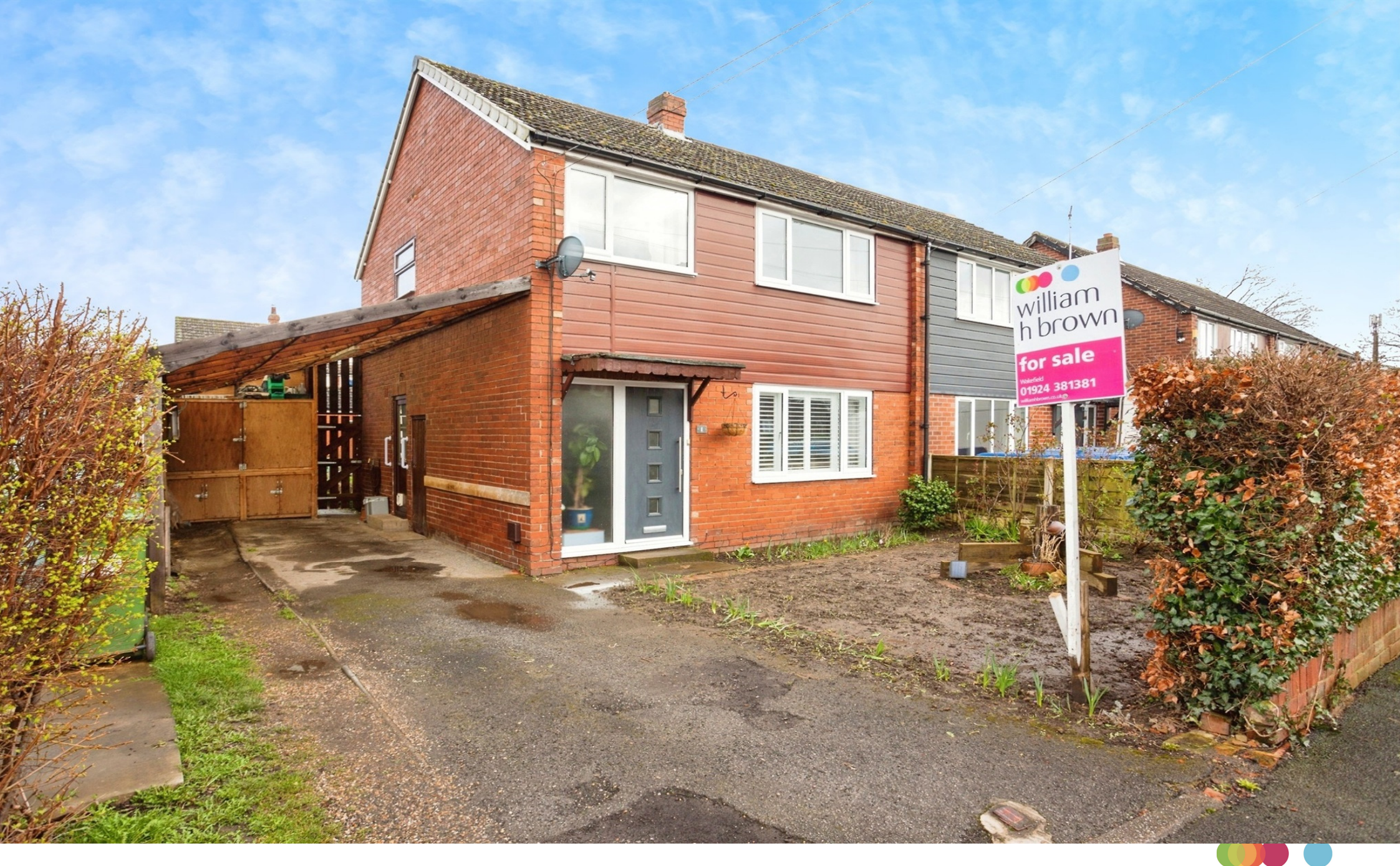
Mayfield Rise, Ryhill Wakefield WF4 2BX