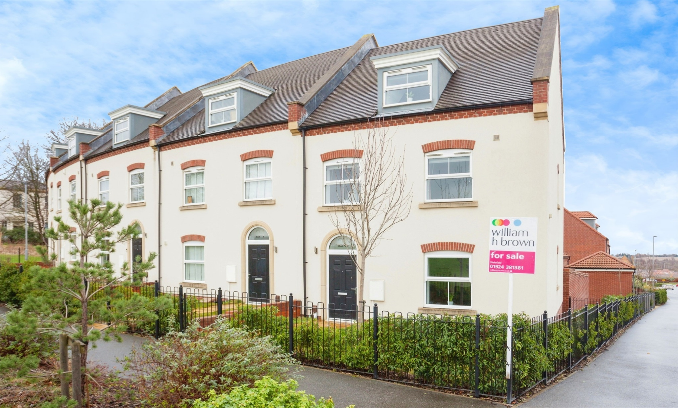
Pilkington Close, WAKEFIELD WF1 4FF