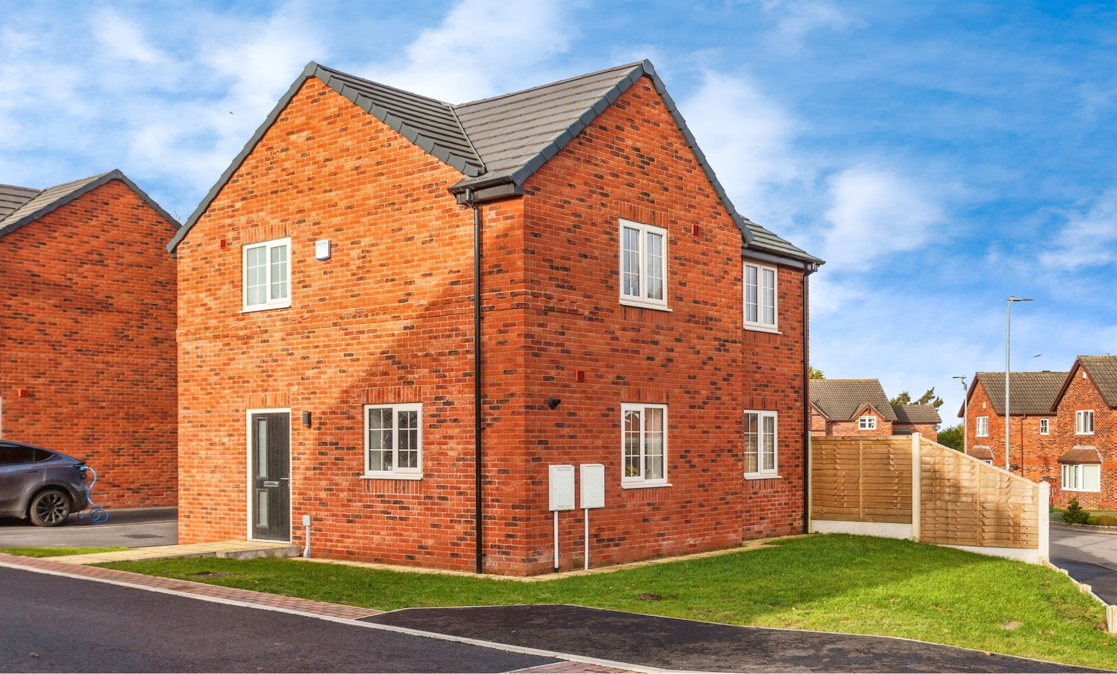
Timbertops Chase, East Ardsley Wakefield WF3 2FX