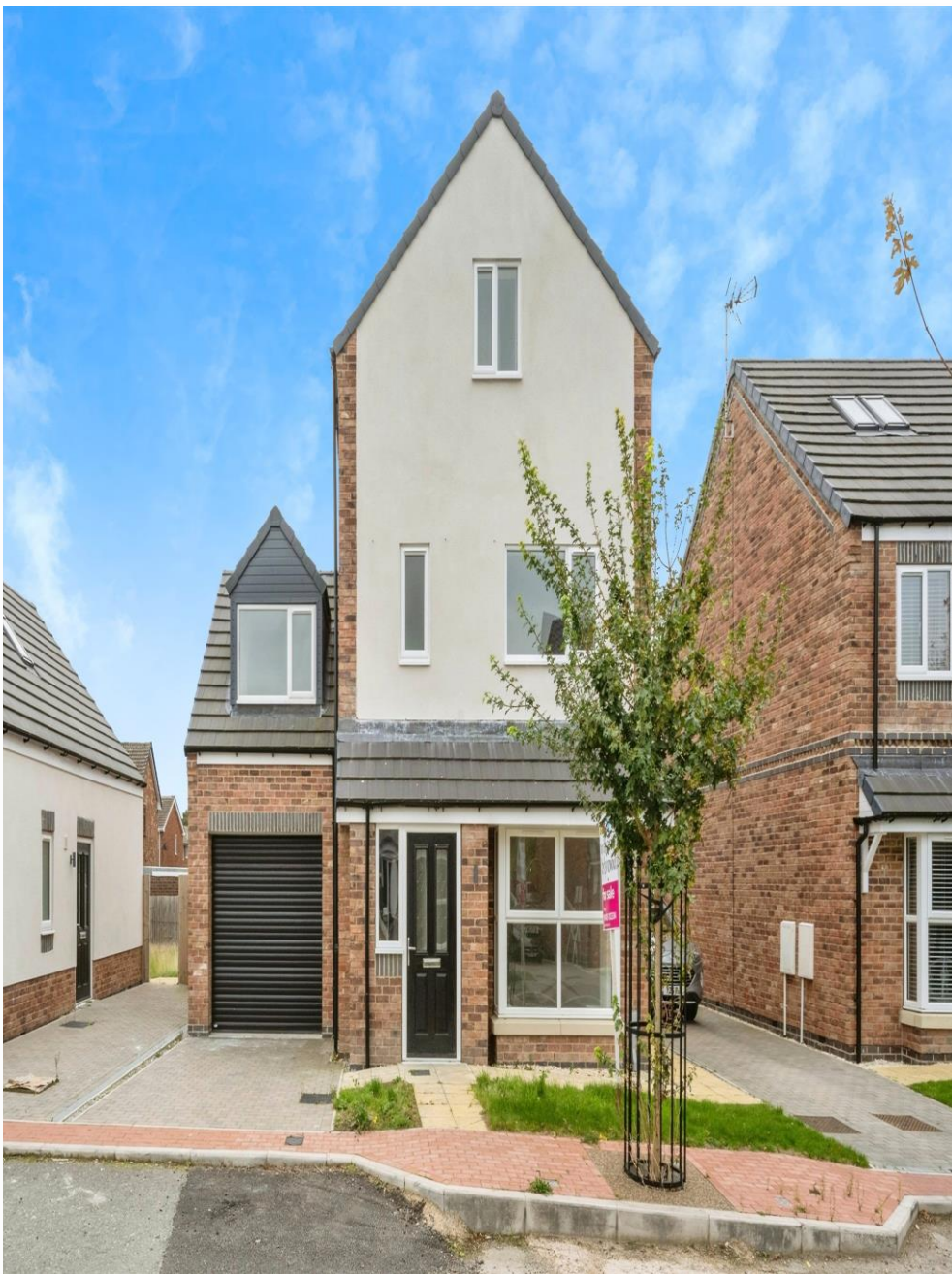
Robin Hood Grove, Thorne Doncaster DN8 4FH