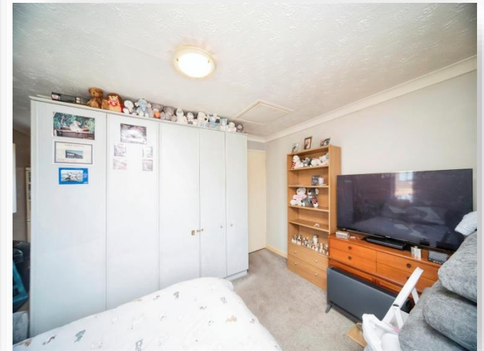
Columbine Close, Thetford, IP24 2YF