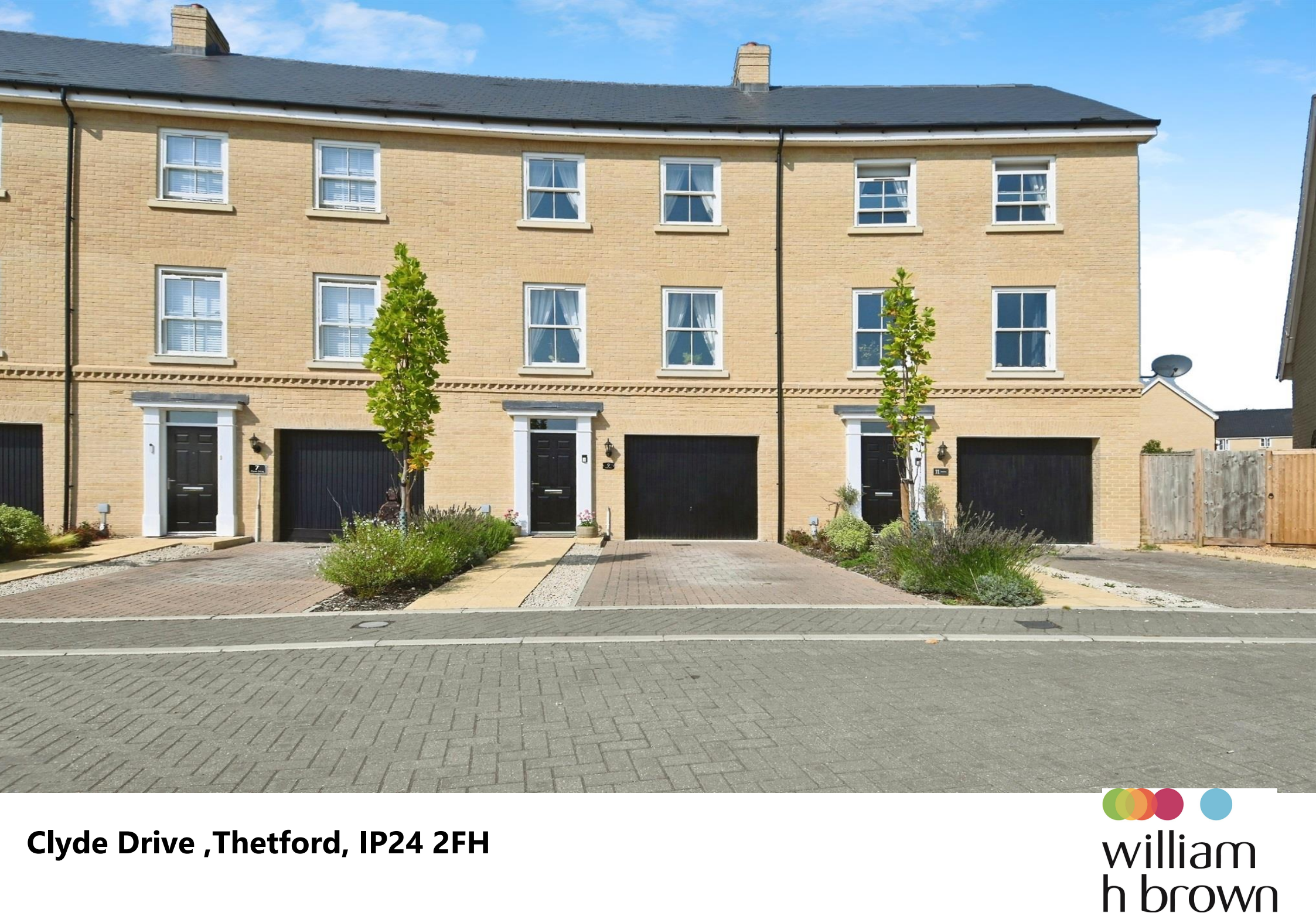
Clyde Drive , Thetford, IP24 2FH