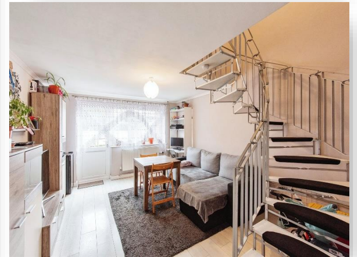
Tennyson Way, Thetford, IP24 1LD