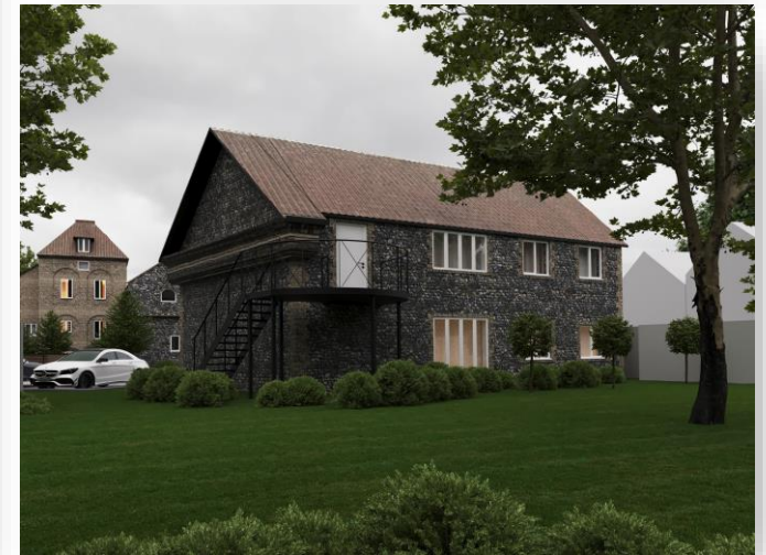
The Maltings, Old Market Street, Thetford IP24 2EQ