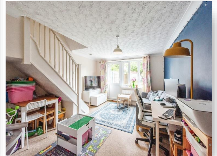
Bluebell Close, Thetford, IP24 2DG