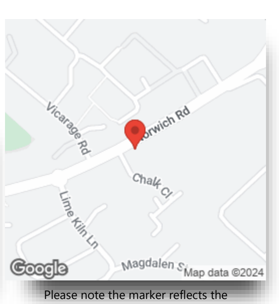
check out more properties at williamhbrown.co.uk