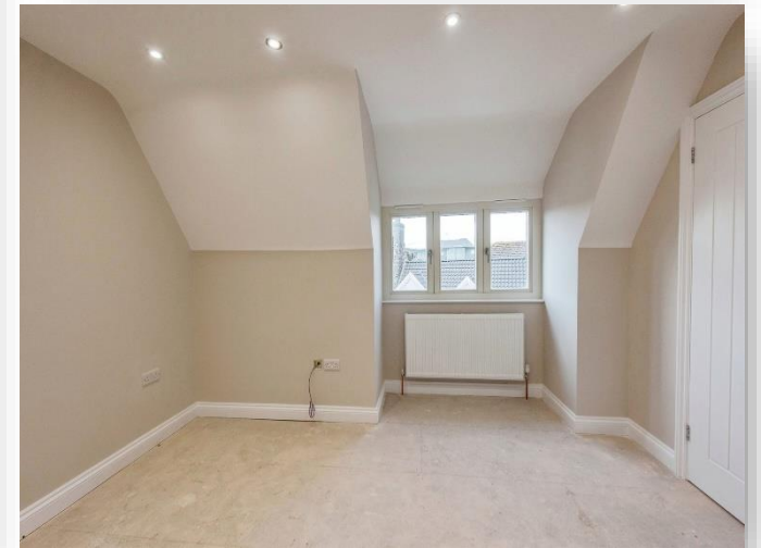
25a Old Market Street, Thetford, IP24 2EQ