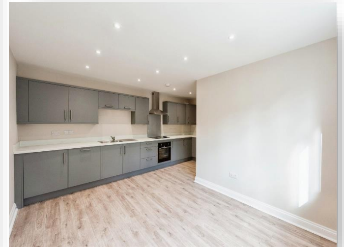
23b Old Market Street, Thetford, IP24 2EQ