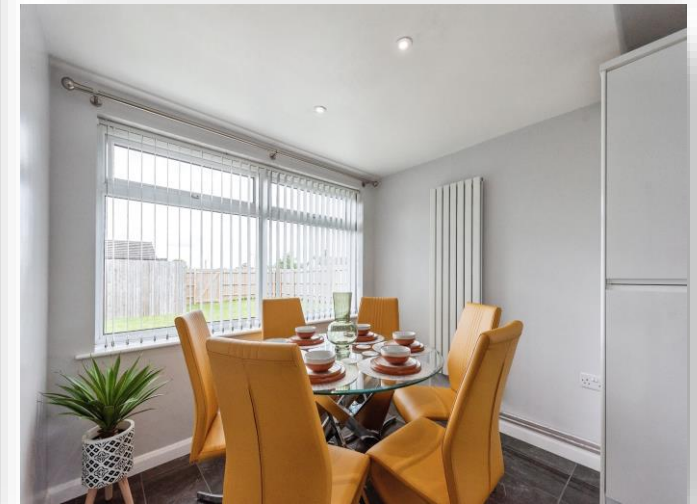
Hamblings Piece, East Harling, Norwich, NR16 2PZ