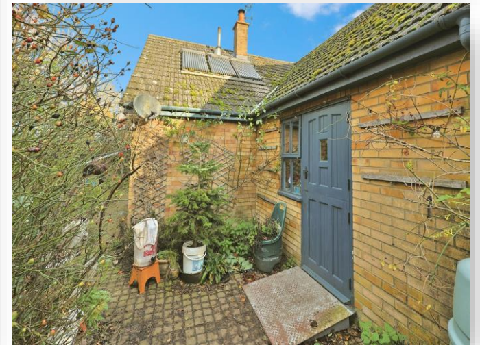
Pightle House, Eastmoor Road, Eastmoor, PE33 9PZ