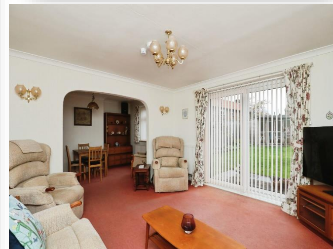
Hillside, Marham, PE33 9JJ