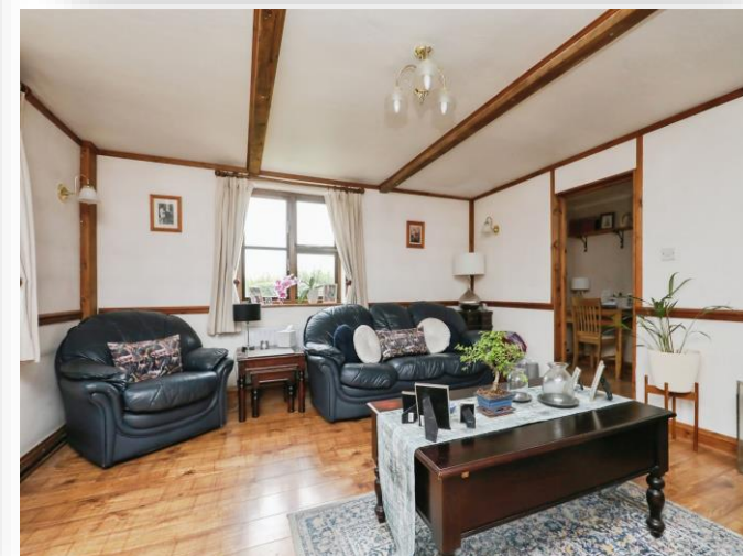
Jays Cottage, South Pickenham Road, Swaffham, PE37 8DA