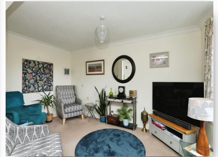
Goodrick Place, Swaffham, PE37 7RP