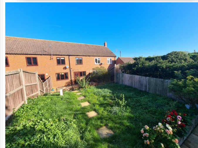
Church View Back Road, Pentney, PE32 1JW