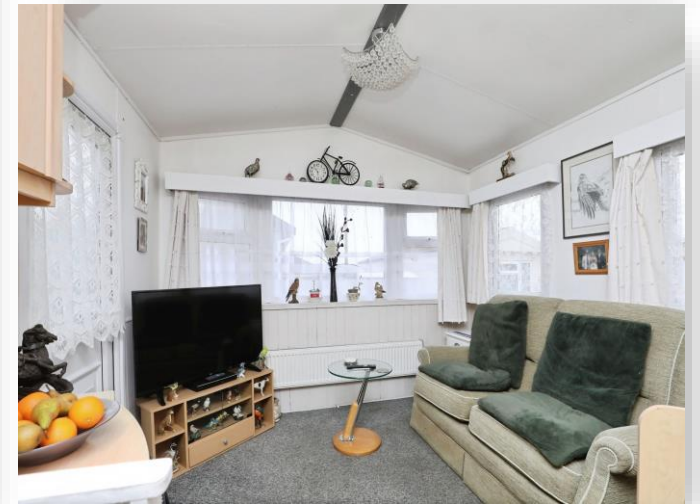
Bells Park, Lynn Road, Swaffham, PE37 7BN