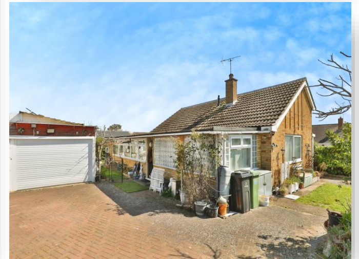
Westfields, Narborough, PE32 1SY