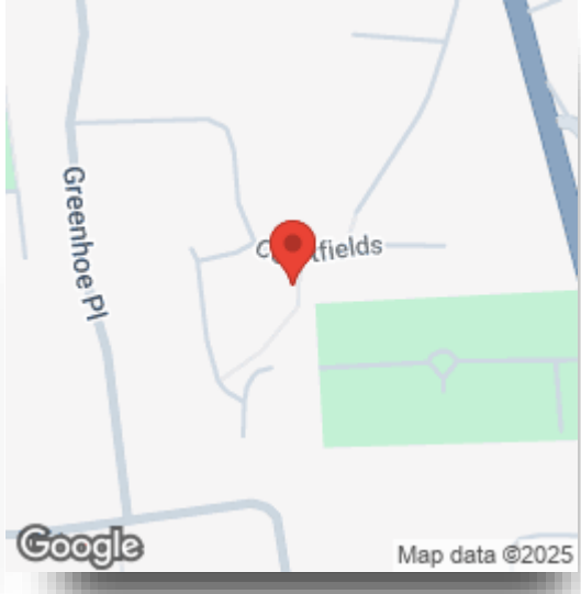
Please note the marker reflects the postcode not the actual property