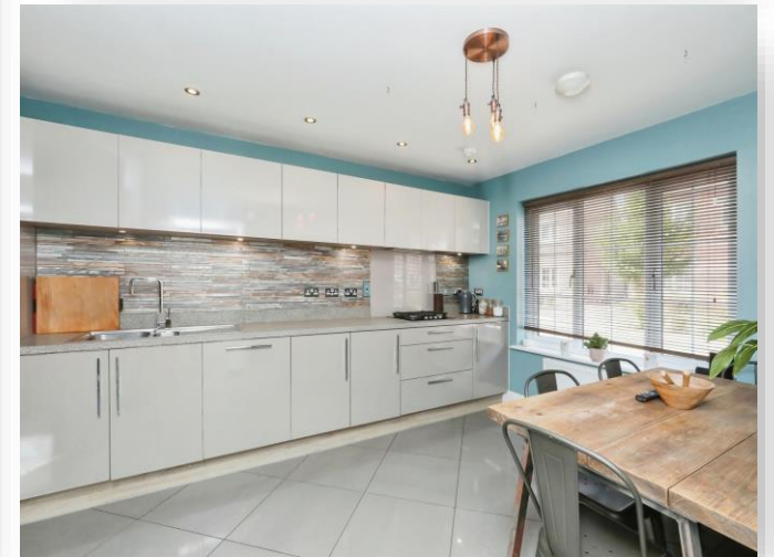
Rix Place, Swaffham, PE37 8GD