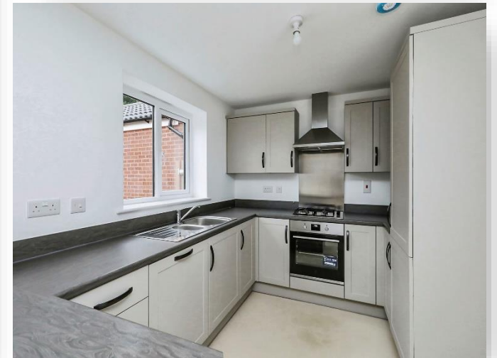
Corfe, Pedlars Meadow, Norwich Road, PE37 8DD