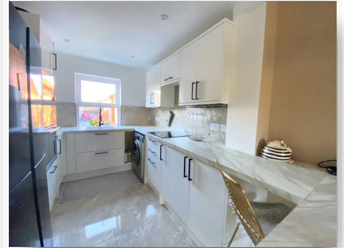
Cateryne Court, Spinners Lane, Swaffham, PE37 7ND