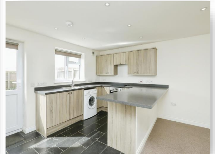
Sandringham Way, Swaffham, PE37 8BS