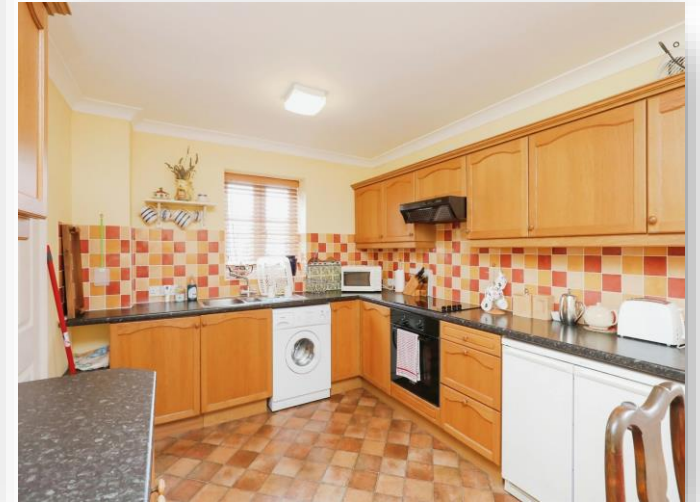
Pales Green, Castle Acre, King's Lynn, PE32 2AL