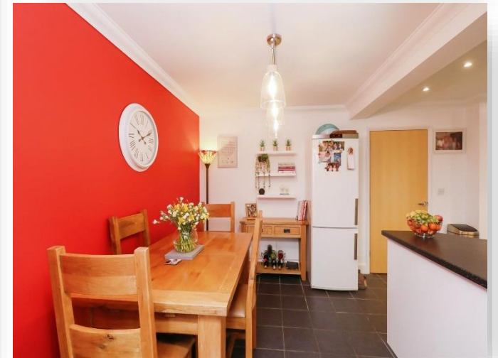
Laburnum House, The Street, Marham, King's Lynn, PE33 9HP