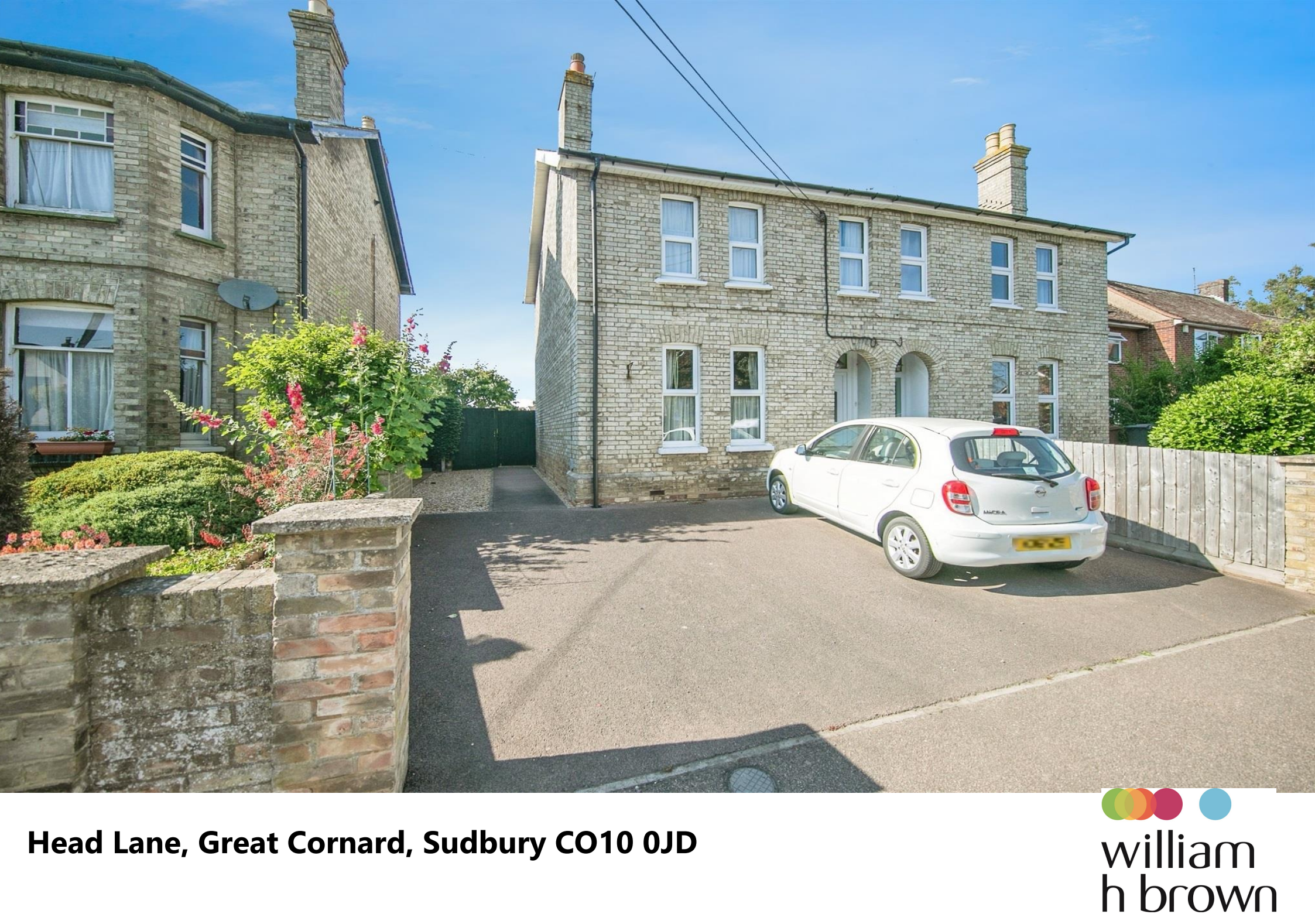
Head Lane, Great Cornard, Sudbury CO10 0JD