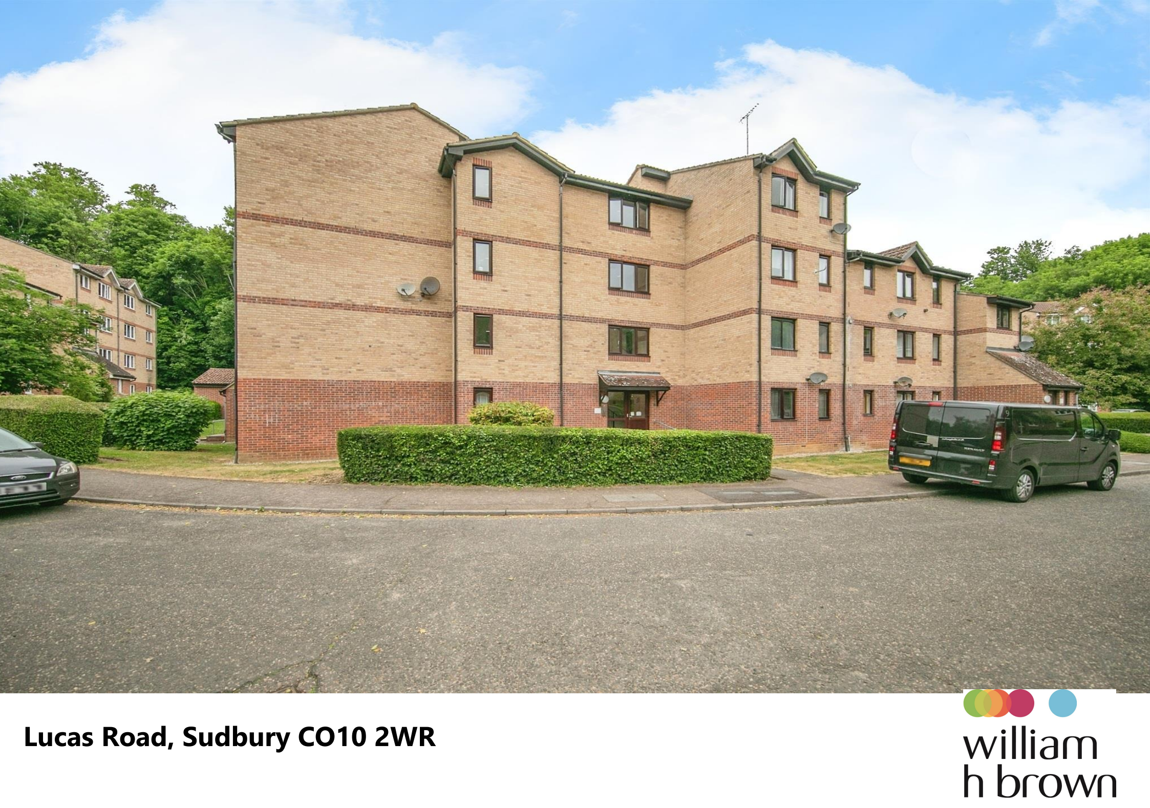
Lucas Road, Sudbury CO10 2WR