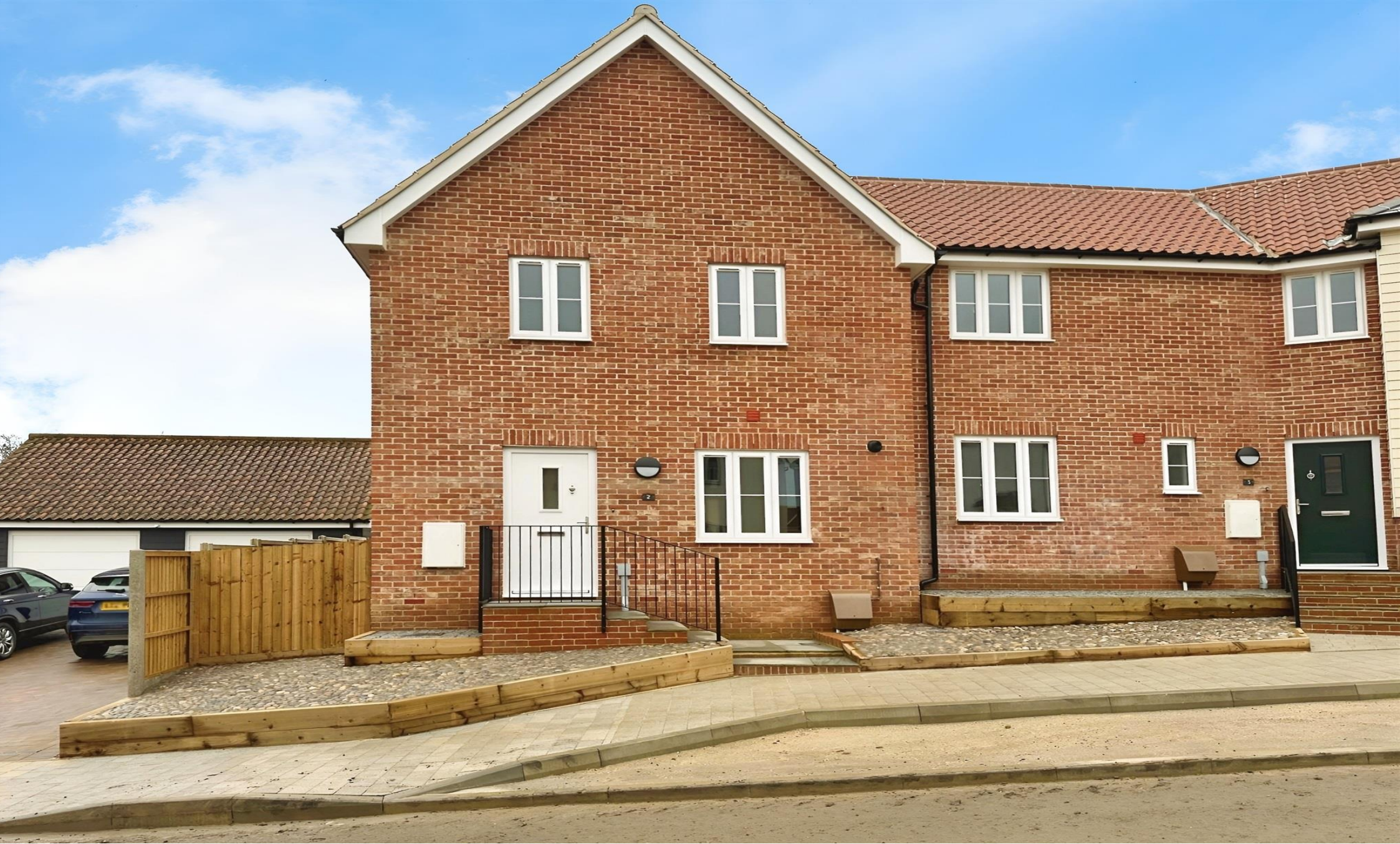
The Paddocks, Lavenham, Sudbury CO10 9PU