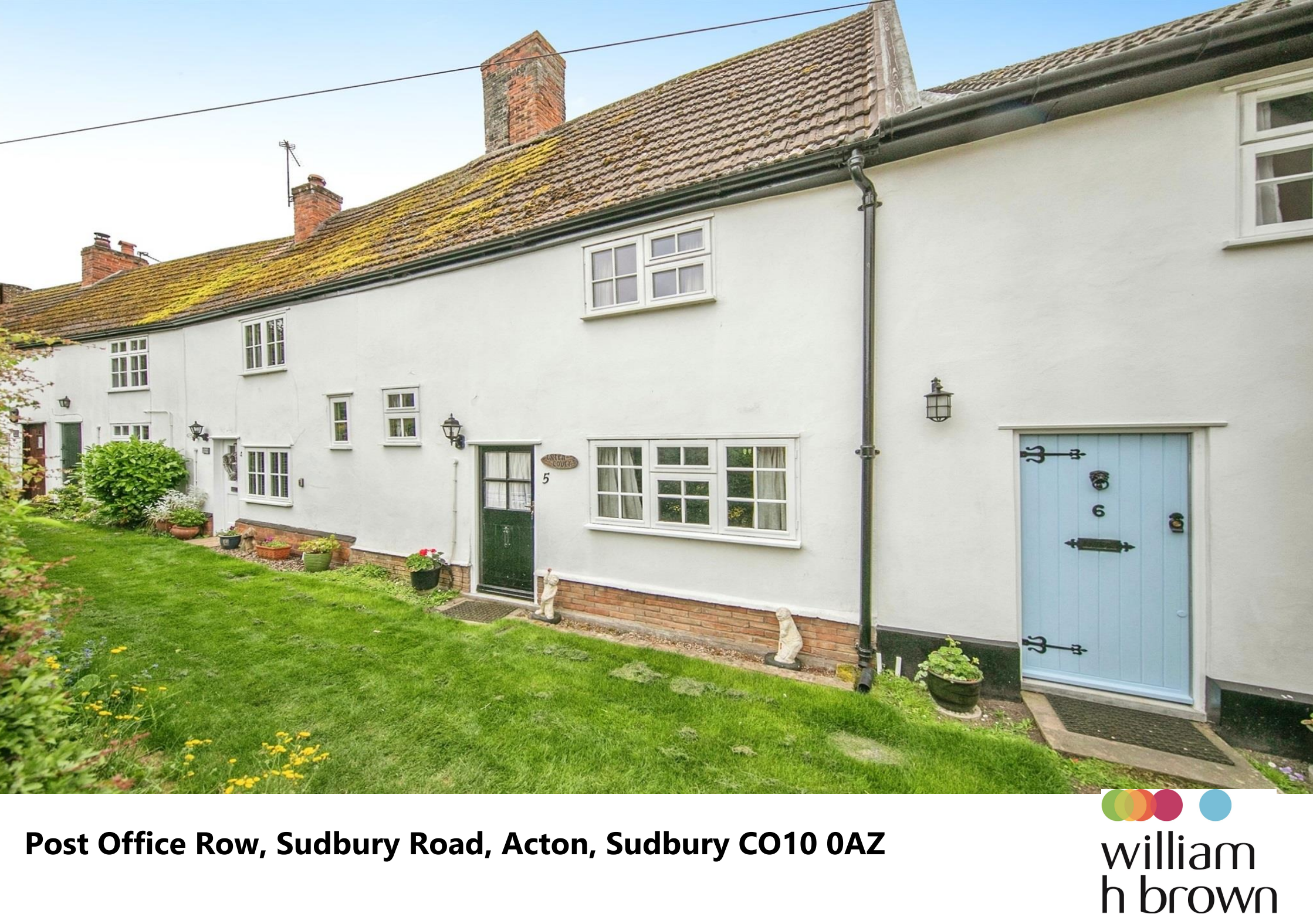
Post Office Row, Sudbury Road, Acton, Sudbury CO10 0AZ