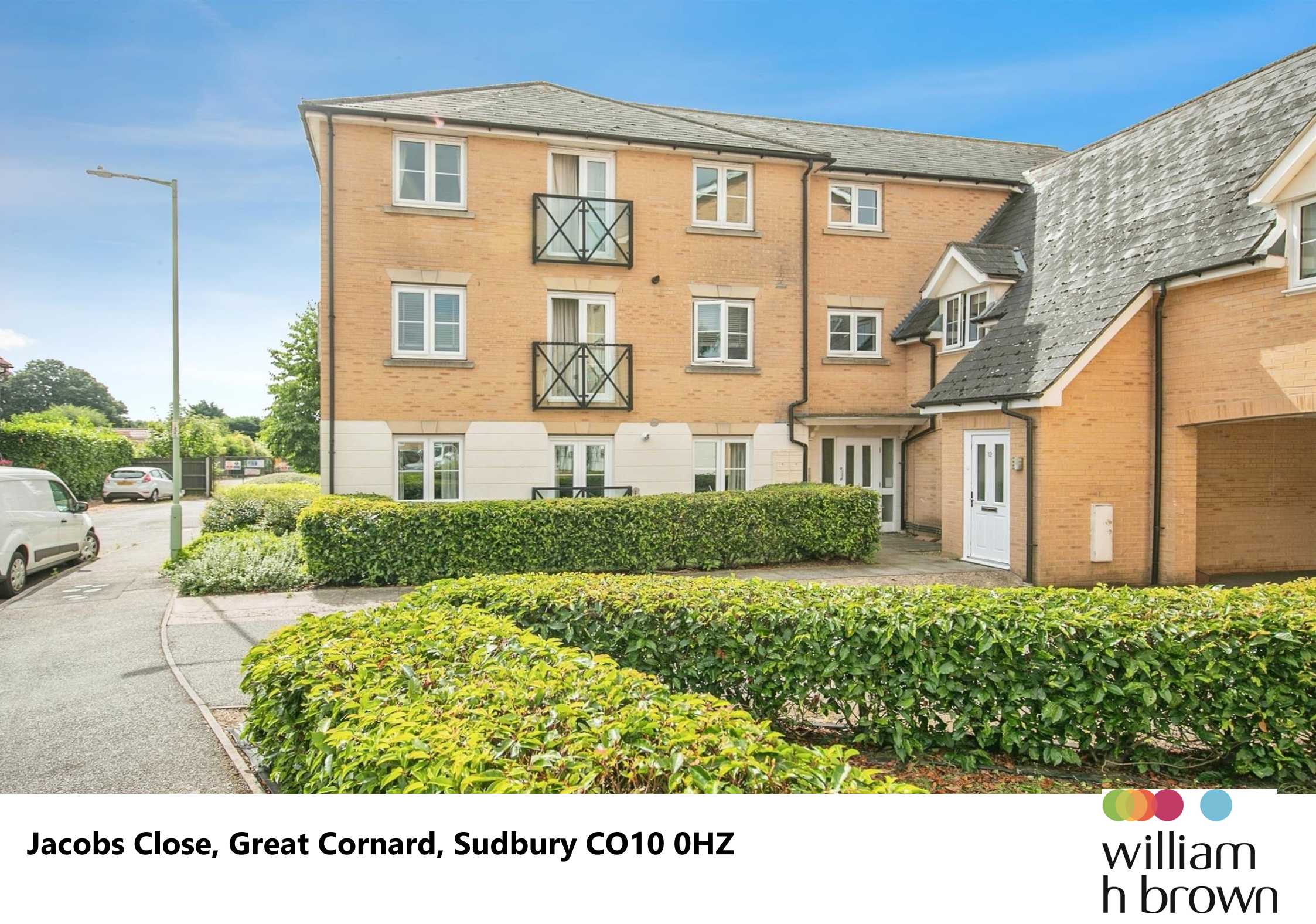
Jacobs Close, Great Cornard, Sudbury CO10 0HZ