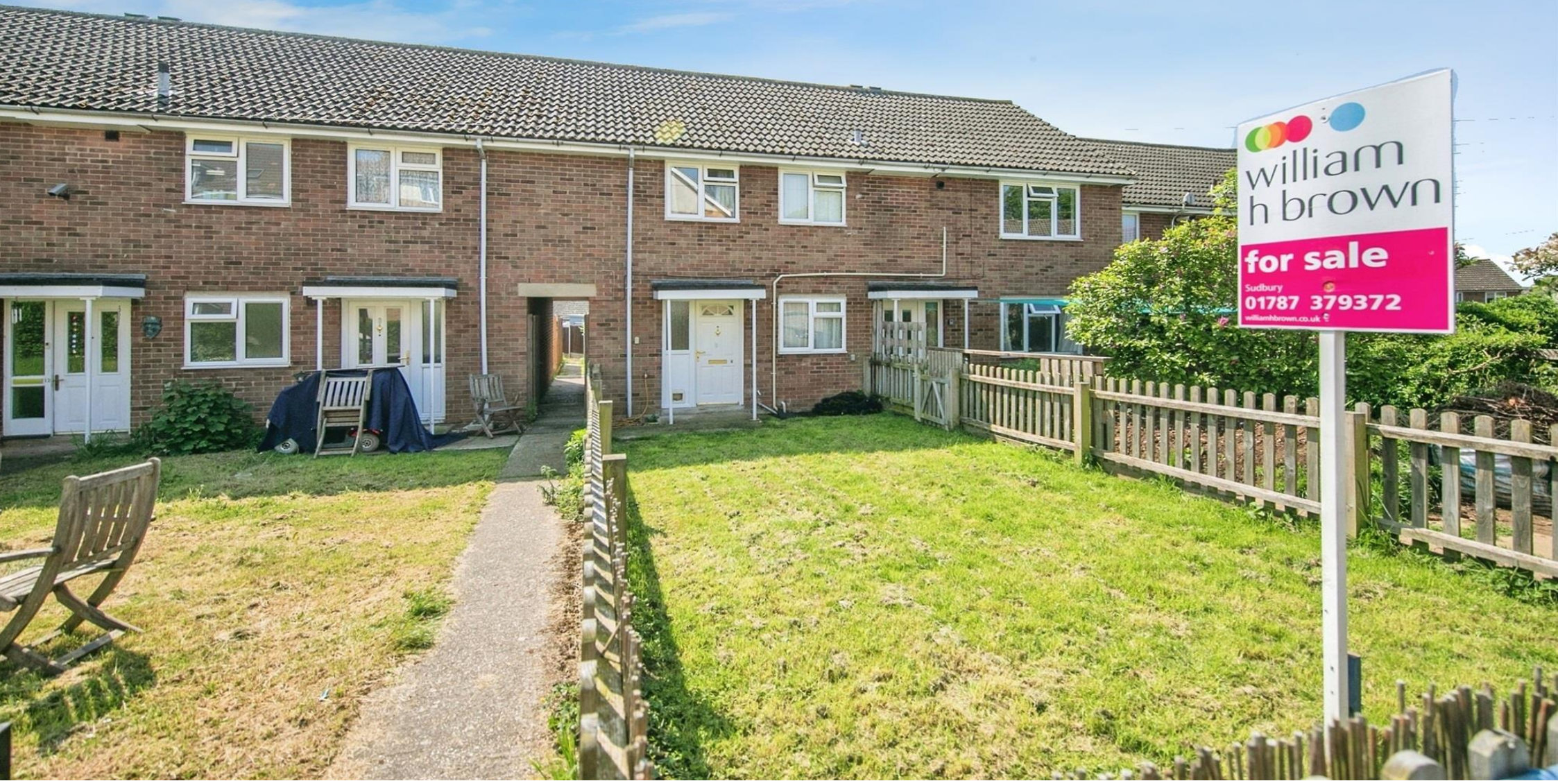
Butt Road, Great Cornard, Sudbury, CO10 0DS